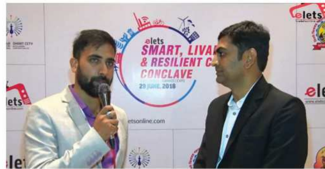
At Pune Smartcity Conclave