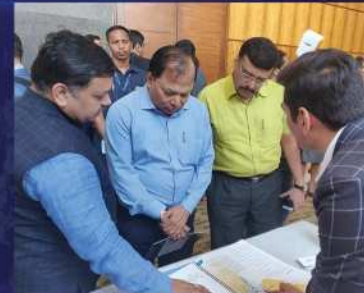
At Pune exhibition