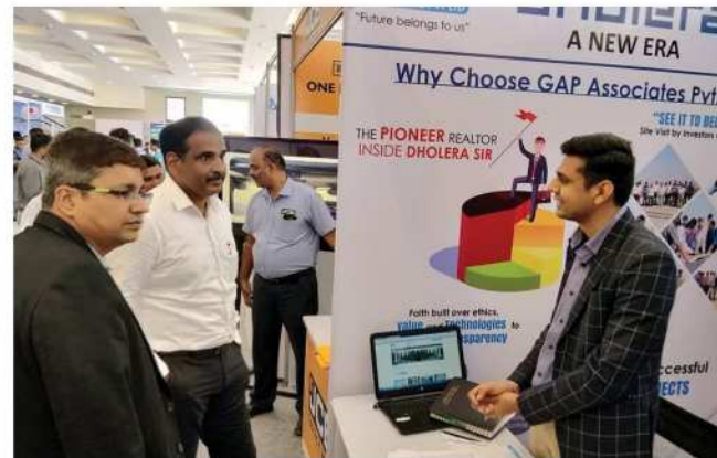
Explaining Dholera SIR to Muni. Commissioner of Surat

We have arranged 25+ awareness programmes in different Cities, States & Countries through Exhibitions, Seminars, Gatherings, Corporate meetups etc.