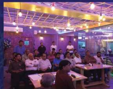
Doctors event at Mumbai