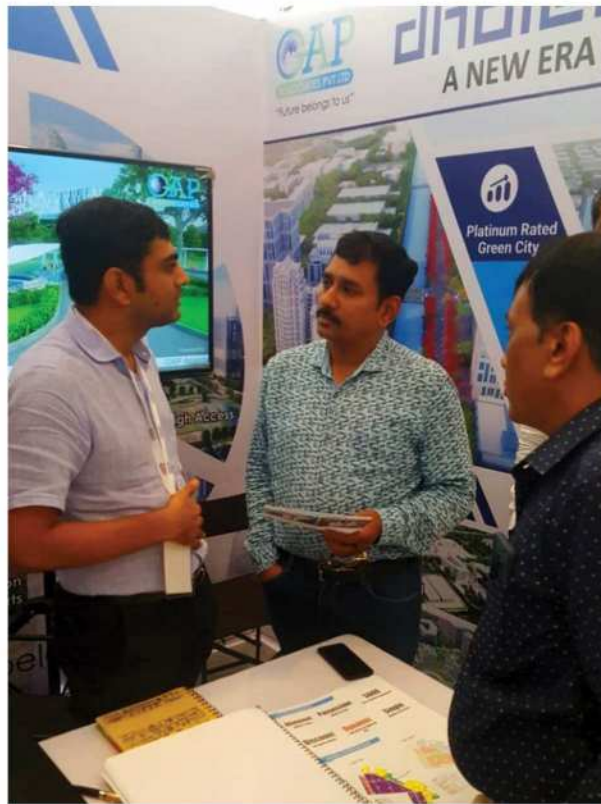
At Smart City conference with Dy. Mayor of Surat city

Reached more than 1,00,000 people through various means of interactions to make them aware about Dholera SIR.