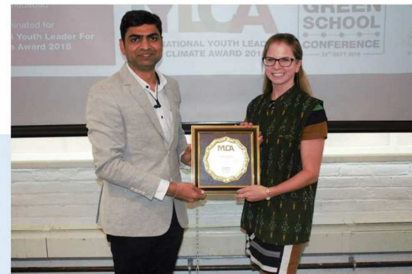
#IYLCA2018 - International Youth leader for Climate change Award 2018, Manhatten, NY, USA