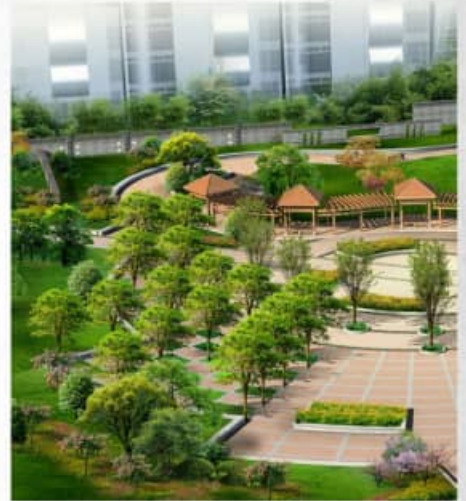
Beside Authority Garden