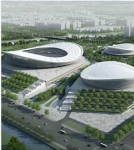
In front of Sports & Recreation Zone