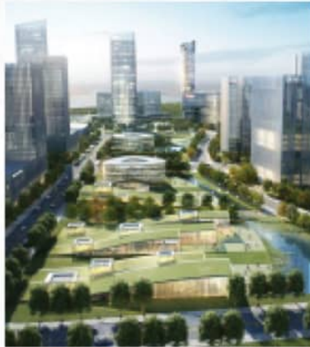
Near to High Access Corridor