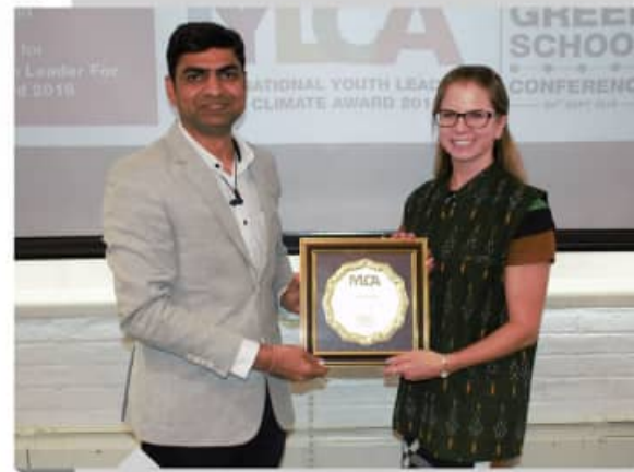
International Youth leader for Climate change Award 2018, Manhattan, NY, USA

I have been Regular investor of Real estate But they have won my heart with their Professionalism.